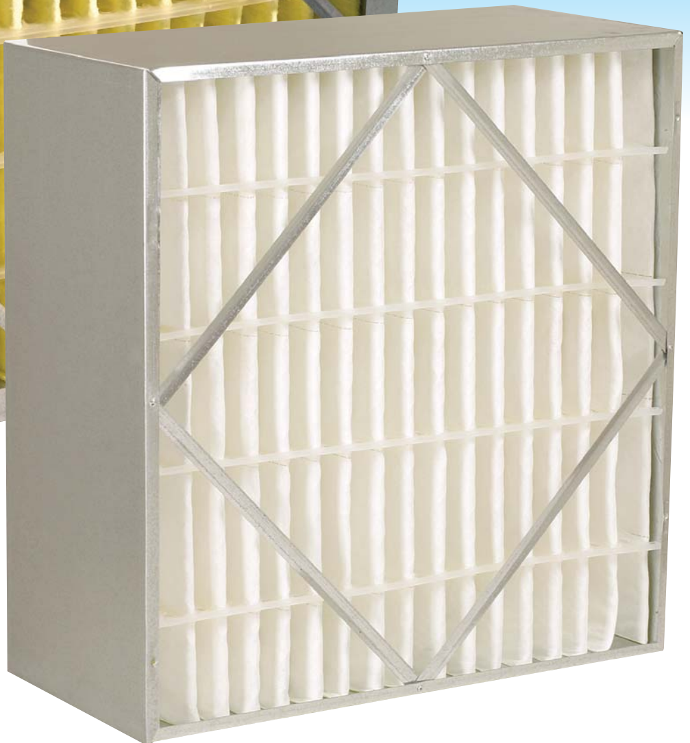
Box Style (Synthetic Media)