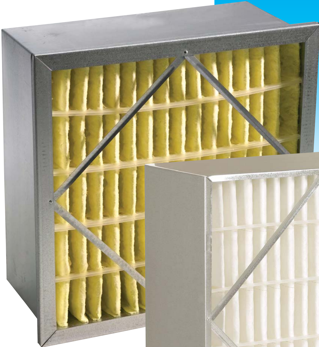
PH Model with Header (Microglass Media)

Extended Surface Rigid Cell Filters Dual Layer, Microfine Synthetic Media High Loft Microglass Media