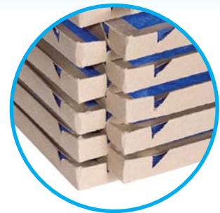
Pinch Frame Design